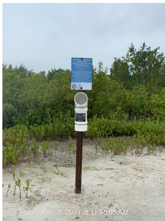
Jan 19, 2024 at 11:45:05 AM

Page 2 is a summary of our concerns and discussion at the meeting. The good news is that Ms. Edwards has been very proactive since the meeting and they have re-installed the fishing line receptacle and installed roped fencing to replace the ugly orange cone that was at the front entrance of the park. See pictures below: