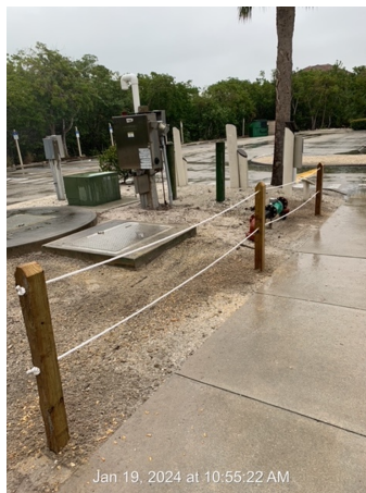
Jan 19, 2024 at 10:55:22 AM

The Friends of Tigertail board of directors are doing